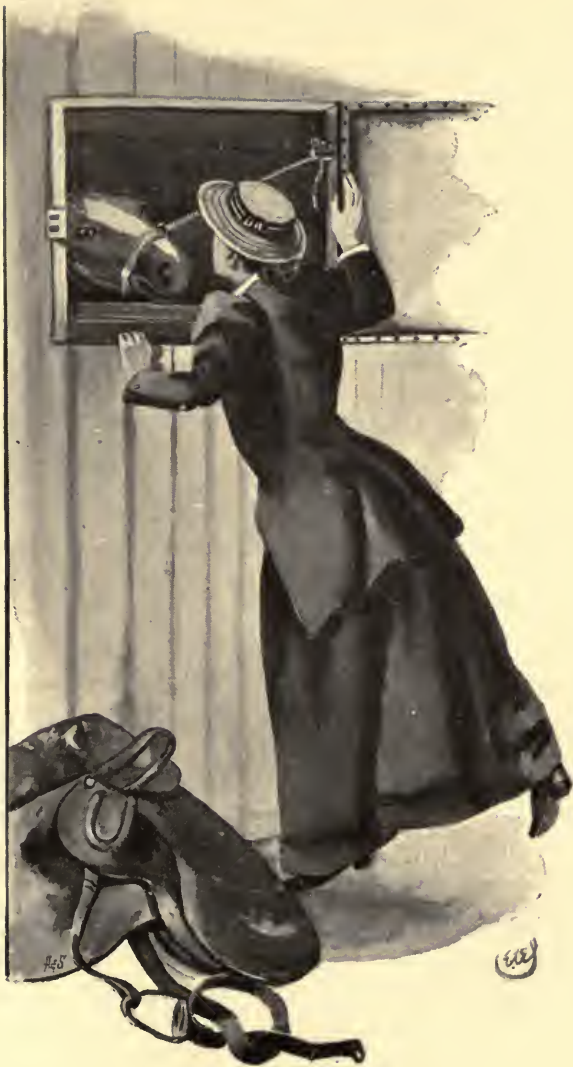
A final salute.